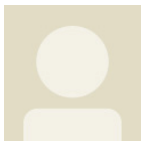
TRANSPORT, ENERGY & CLIMATE